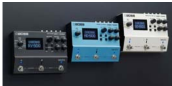
Boss Announces New RV-500 Reverb and MD-500 Modulation...