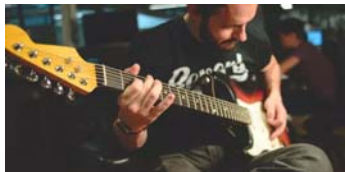
Found at Reverb HQ: The Instruments At Our Desks