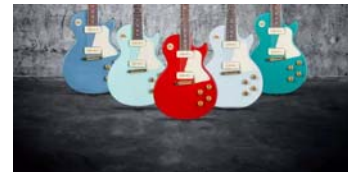
Gibson Announces Custom Shop Les Paul Specials with Vibrant '60s...