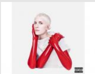
Cool Spin: Yacht, 'I Thought the Future Would be Cooler'