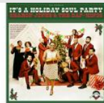
Cool Spin: Sharon Jones & the Dap-Kings, 'It's a Holiday Soul Party'