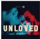
Cool Spin: Unloved, 'Guilty Of Love'